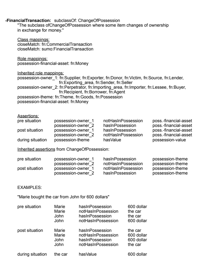
Figure 2: Non-formal transcription of the mappings, assertions and instantiation for the ESO class FinancialTransaction

ESO is a hand-built resource, based on high-frequent FrameNet frames that were extracted from a large domain-specific document collection. We mapped these frames manually to the SUMO ontology <sup>3</sup>, to derive an initial conceptual structure. As such, we derived four main conceptual clusters that formed the backbone of ESO: 'changes in possession', 'translocations', 'internal changes' and 'intentional events'. Next, we modeled 103 FrameNet frames